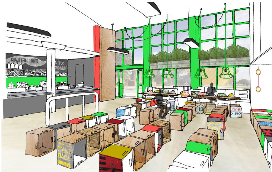
The Waiting Room, St Botolph's – Colchester

The Waiting Room is itself founded upon an innovative ' borrow/barter/buy/bespoke ' approach to business integration for library-hack-makerspaces . This is intended to help maintain the ethos of a public library, where its function to 'facilitate access to all' is concerned, at the same time as introducing an income generation or 'library enterprise' dimension to operations. We sought to research and took steps to replicate/iterate elements of the Waiting Room initiative elsewhere over a period of three months and, with that, began to explore the potential to establish an income generating library-hack-makerspace network with a grant from Arts Council England.